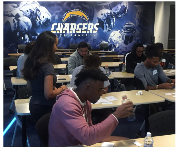
RISE rookie session with the Los Angeles Chargers in December 2017.

RISE offered teams a choice of two workshops based upon the type of conversation in which teams wanted to engage. One option was a workshop titled “Identity & Diversity: What do you bring to the huddle?” that allowed rookies to explore their identities and biases and reflect on what it means to be a professional athlete. Diversity was discussed as something to be celebrated as it broadens our perspectives and expands our skill base. The second workshop, “Perspective Taking,”