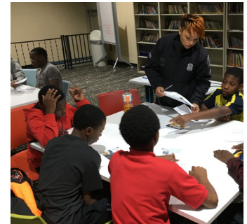
RISE, the Detroit Pistons, S.A.Y Detroit Play and the Detroit Police Athletic League team up for the Building Bridges Through Basketball program with local youth.