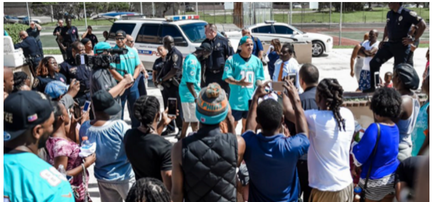
October 2017 meeting and ride-along with the North Miami Police Department and Broward County Sheriff's Office.