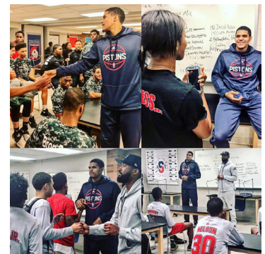
Detroit Pistons players visit a Detroit area high school.