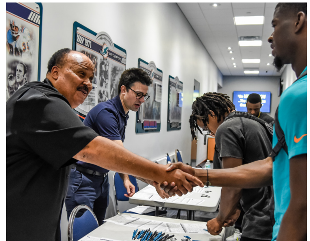
Martin Luther King III and RISE work with the Miami Dolphins to register players to vote.

RISE to Vote – Working with RISE, state and local election officials and nonpartisan organizations, several teams in professional sports leagues engaged in discussions about the history and importance of voting and having a voice and, ultimately, registering to vote. The San Antonio Spurs, Brooklyn Nets, Atlanta Hawks, Atlanta Falcons, Los Angeles Rams and Miami Dolphins participated in this program in which Martin Luther King III and others highlight the importance of being informed and engaged citizens. The goal at each session is to inspire team members and players to register to vote regardless of their political affiliation and engage them as leaders among their peers and fans to encourage them to do the same. The project, recent recipient of a Democracy Fund Voice grant, resonates with players and teams and has opened their eyes to the power they can have in their communities.