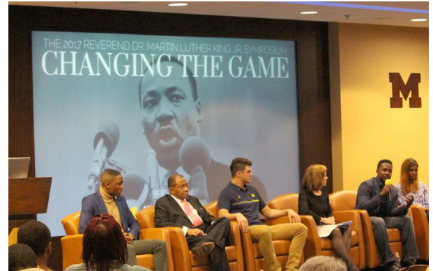
University of Michigan and RISE collaborate for an MLK Day town hall in 2017.

Community conversations and town halls – Teams have hosted town halls and community conversations in which their owners, players, lawmakers, fans and youth have been able to have structured, solutions-focused conversations and debate about the state of race relations and the actions that players have taken and would like to take. Focused on empowerment and encouraging advocacy, these conversations allow people from varying backgrounds to hear and articulate relevant perspectives and move the conversation forward in a positive manner. Sometimes, they also have an educational component in which youth and coaches have discussions about these tough issues. At other times, they have subject matter experts who are able to provide expertise and guidance around difficult matters. Some of these conversations have been held with the Golden State Warriors, New York Liberty, Indianapolis Colts and Atlanta Falcons. Others also have been at colleges and universities, such as the University of Michigan and San Jose State University.